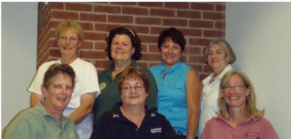
Picture of Council Members appointed by the 5 Congressional Districts;

The public is always welcome to attend. You may also contact any of the Council members if there are any equestrian issues you would want to have addressed.