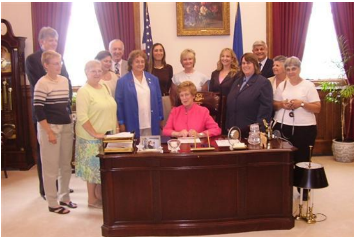
2007 Signing of Equine Advisory Council Bill with Governor Rell