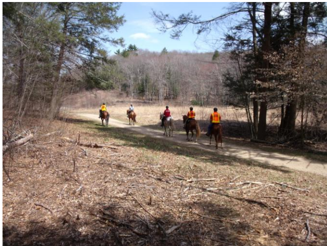
On the trail to the look out