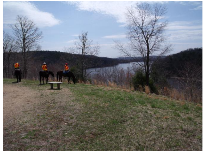
Salmon River View look out